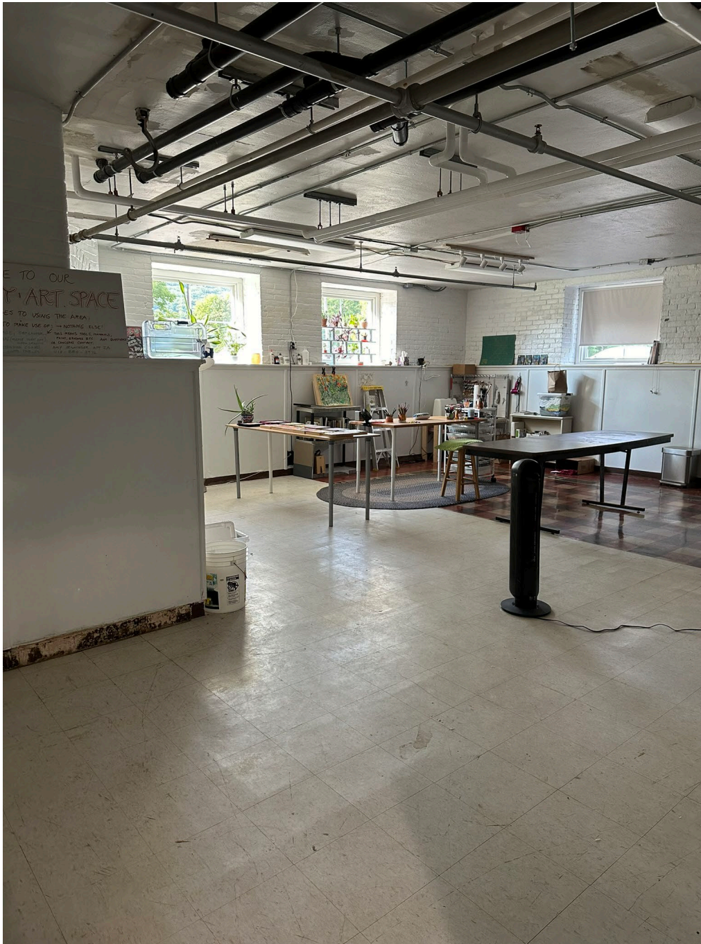
Old Gym area – tenants using for art / creative space