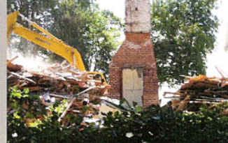
above: Dartmouth farmhouse after demolition