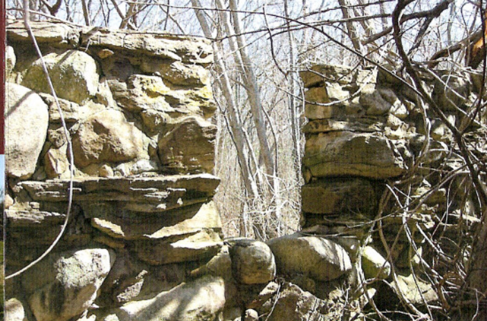
left panel: Barn foundation on Dartmouth's "McBratney parcel" adjacent to DNRT's Little River Reserve