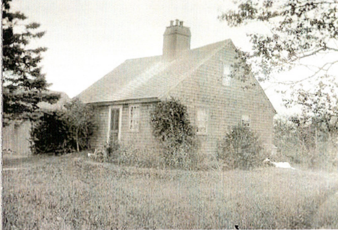
above: 1762 Elihu Akin house, photo dated 1905; cover: Elihu Akin house, 2007

or Peggi Medeiros, Clerk , (508) 992-9624 pmedeiros@comcast.net